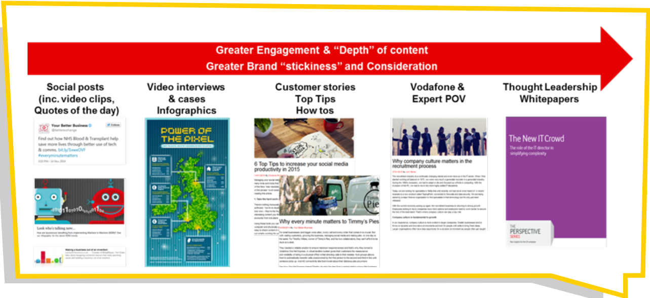
Fig2: Types of content served up by 'Your Better Business.'

As the platform's success has been recognised throughout the organisation, and backed up by interviews with business decision makers who confirmed the importance of relevant content to their views, the 'Your Better Business' platform and content has become a central cog for Vodafone's enterprise communications activity.